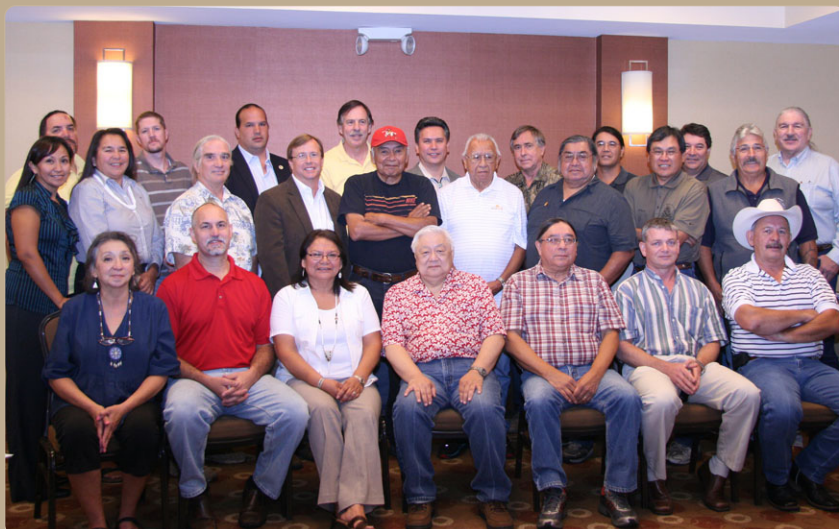
The ONR working group met in August in Denver, CO. More than 15 intertribal and federal agency partners met at this meeting.

You can see the trailer for this DVD at our website store: GWR Products: http://www.wildliferesources.org/g-w-r-products/